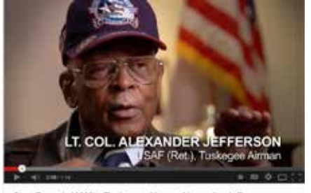
Shot Down in WWII - Tuskegee Airman Alexander Jefferson

URL: <a href="http://www.pinmaps.net/PrintMap.aspx?MapId=29078&Version=Map">http://www.pinmaps.net/PrintMap.aspx?MapId=29078&Version=Map</a>